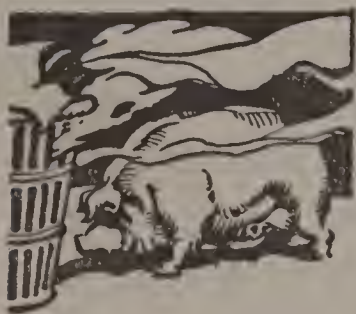
The Pig Began to Squeal.

EVELYN had seen some very cunning little pink baby pigs that day, and she thought it would be lovely to have a little pig as a pet. Jack didn't think it would be so nice.